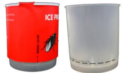
Heat resistant container with water level indication